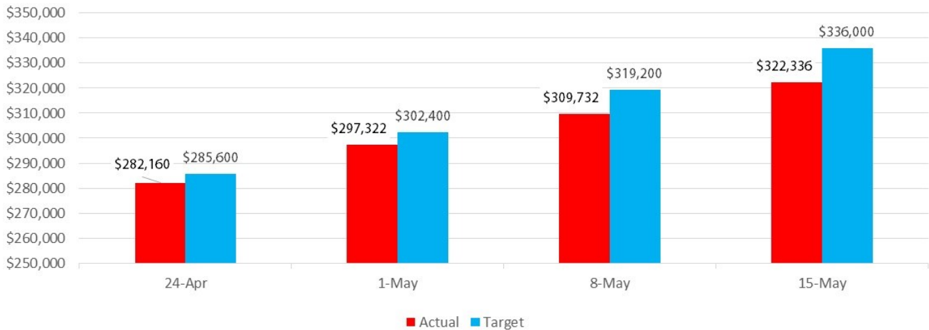
SLC CUMULATIVE OFFERING GIFTS

Actual = offerings received to date (General/Restricted Funds) Target = offering goals (execution based on 90% of approved congregation budget)/52 weeks The above reflects us behind in our offerings target