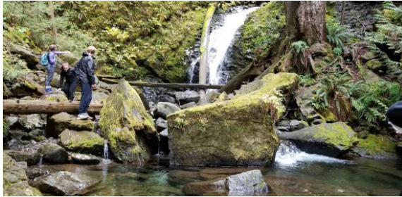
Waterfall hike at the Confirmation Retreat