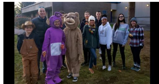
Serving at Esquire Hills’ Trunk or Treat