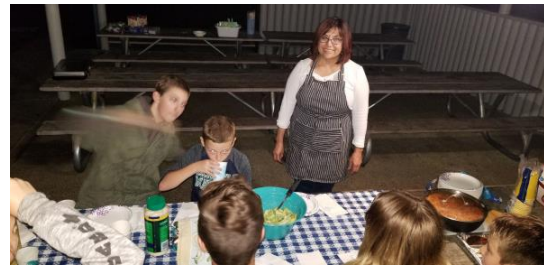
Amazing dinners at Fall Campout

middle camp was another on the list of “didn’t happens,” even though we postponed our original June dates to August. In fact, Lutherhaven closed for the summer this year as did most other camps in our region. I found it ironic that both our original June week and our hoped for August week had the best weather we would have had in 5 years, but again, that makes our hope all the more fervent for gathering when we can. I am also excited by a new collaboration with the young couple that run All Church Camp for Lutherhaven. We will be working together to use our strengths to make both camps a richer experience. Generally, they will take care of most staffing and programming, and I will head up devotions and spiritual formation. I look forward to making this collaboration a reality!