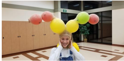
Reindeer Games at the middle

middle camp was another on the list of “didn’t happens,” even though we postponed our original June dates to August. In fact, Lutherhaven closed for the summer this year as did most other camps in our region. I found it ironic that both our original June week and our hoped for August week had the best weather we would have had in 5 years, but again, that makes our hope all the more fervent for gathering when we can. I am also excited by a new collaboration with the young couple that run All Church Camp for Lutherhaven. We will be working together to use our strengths to make both camps a richer experience. Generally, they will take care of most staffing and programming, and I will head up devotions and spiritual formation. I look forward to making this collaboration a reality!