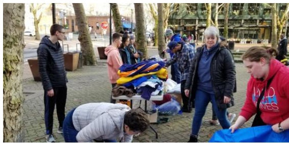
Youth setting up for Socks and Sundries service in Seattle

I explained our new format for Confirmation in my 2019 report, but seeing it lived out last October was a real treat. We had several 10 th and 11 th graders and one 9 th grader affirm their faith on Reformation Sunday 2019 in a wonderful and packed worship service. Earlier in October we had done our first Confirmation Retreat, which ended up being a fun and focused weekend of opening up the faith of our youth. The faith statements that emerged from that weekend led to a powerful worship. That retreat will have to wait this year, and so will the Reformation Sunday worship. Right now the plan is in place and the pieces are coming together to offer a virtual monthly check-in with this year's 10 th graders to nurture them toward affirming their faith this coming spring (or at least explore the possibility). Like most things, this plan will evolve with the families and youth involved, but COVID cannot stop them from making their claim on the faith that has claimed them in baptism. One of the elements of this track is to connect with an older adult around the Eucharist. Two of our students were able to do a visit and build a connection – one on their own and one through our Joy Brigade.