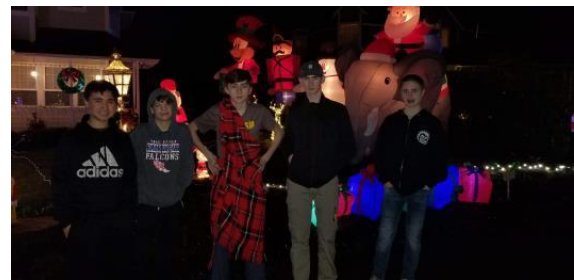
Youth posing during the Lock-In Scavenger Hunt