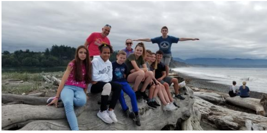
Hiking on the Dungeness Spit during Fall Campout