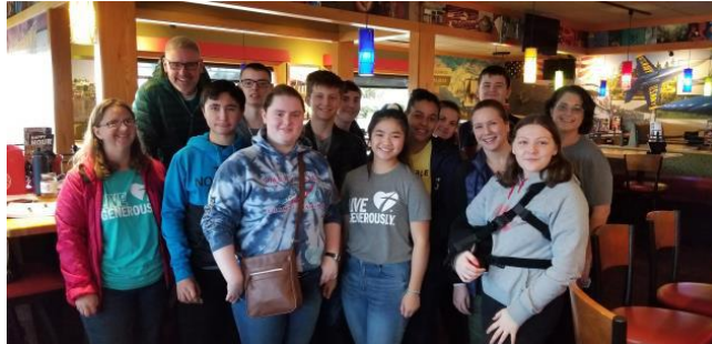
Fundraising at Applebee’s Breakfast

The first “didn’t happen” came the Sunday after our last retreat, which was supposed to be the Youth Auction . We scrambled to postpone and re-scheduled for this fall, but it has seemed best to us for a number of reasons to put several items online for sale and be at the ready for an in-person gathering when that becomes possible. The reality is that if we cannot gather for the auction, we are not going on a trip. So we will tie the excitement and energy of both together when our hope is realized. We obviously had no choice but to cancel our 2020 Summer Servant Trip to Costa Rica, but the group decided they wanted to keep that important international trip for 2021, or whenever we can travel together once again. We also put a backup plan to possibly do another visit with the Blackfeet Nation in 2021 if we can travel locally but not internationally.