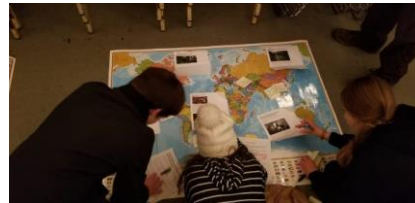
Praying for the world at the Spring Retreat