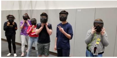
Gearing up for games at the Spring Retreat