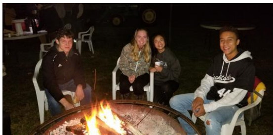
Camp fire at the Corn Maze