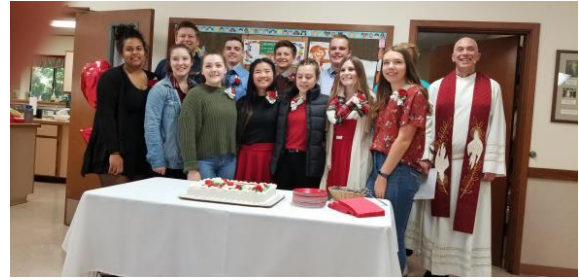
Confirmation Sunday in October 2019

I explained our new format for Confirmation in my 2019 report, but seeing it lived out last October was a real treat. We had several 10 th and 11 th graders and one 9 th grader affirm their faith on Reformation Sunday 2019 in a wonderful and packed worship service. Earlier in October we had done our first Confirmation Retreat, which ended up being a fun and focused weekend of opening up the faith of our youth. The faith statements that emerged from that weekend led to a powerful worship. That retreat will have to wait this year, and so will the Reformation Sunday worship. Right now the plan is in place and the pieces are coming together to offer a virtual monthly check-in with this year's 10 th graders to nurture them toward affirming their faith this coming spring (or at least explore the possibility). Like most things, this plan will evolve with the families and youth involved, but COVID cannot stop them from making their claim on the faith that has claimed them in baptism. One of the elements of this track is to connect with an older adult around the Eucharist. Two of our students were able to do a visit and build a connection – one on their own and one through our Joy Brigade.