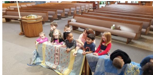
Blessing quilts at Preschool Chapel