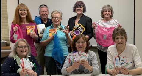
May 30th Bridging the Gap Prep Crew