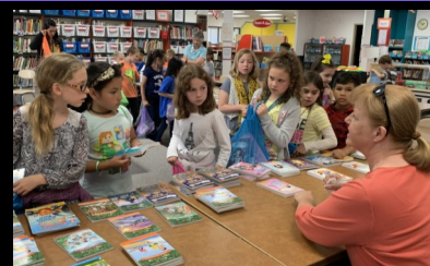
Book Distribution at Esquire Hills on June 17th