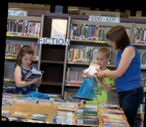
SLC members serve on the staff of Esquire Hills and as volunteers.

Each child received a cool mesh backpack with a name tag to hold their new books.