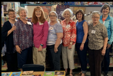
SLC members volunteer as Reading Buddies for 2nd graders at Silver Ridge